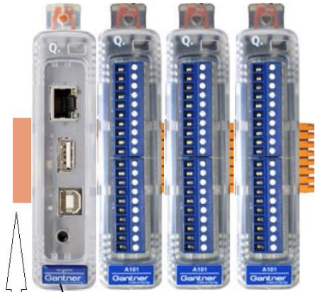
Q.bloxx-CONL80 (shipped with a Q.gate IP)